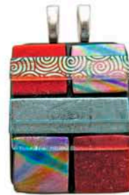
QT005 Dark Red