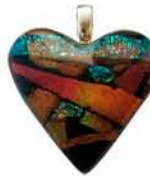
HRTL007 Dark Red/Gold