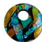
EMB005 Red/Gold Green