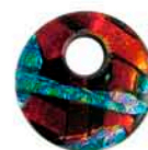
EMB007 Dark Red/Gold