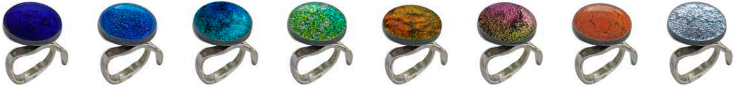
R001 Purple/Blue R002 Silver/Blue R003 Blue/Green R004 Blue/Green/Gold R005 Red/Gold/Green R006 Pink/Gold R007 Dark Red/Gold R009 Silver

Rings are a beautiful and affordable way to remember your loved ones. Available in eight color schemes , The rings feature a stunning glass bead affixed at the top of a sterling silver base that is open in the back, making it easily adjustable to fit most sizes. The rings always contain ashes (hidden) and are approximately 3/4" in size .