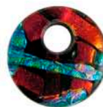
EMBL007 Dark Red/Gold