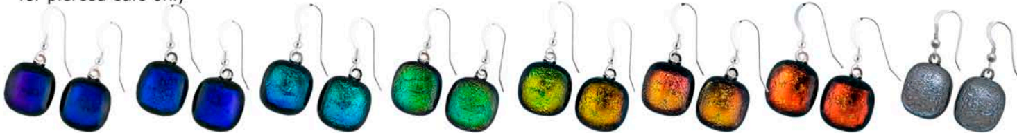
AC001 Purple/Blue AC002 Silver/Blue AC003 Blue/Green AC004 Blue/Green/Gold AC005 Red/Gold/Green AC006 Pink/Gold AC007 Dark Red/Gold AC013 Silver