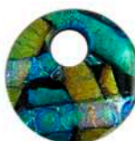
EMBL004 Blue/Green Gold