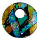
EMBL005 Red/Gold Green