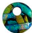
EMB004 Blue/Green Gold